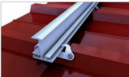
Insertion rail on EPDM with trapezoidal clamp

Very practical for installation on the roof: the insertion system for trapezoidal roofs consists of only a handful of individual components, greatly simplifying installation. For trapezoidal roofs, we use building authority-approved chipless thin sheet screws which are screwed into the trapezoidal metal without producing any chips which could corrode.