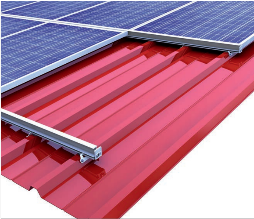
Insertion system with direct fixing and modules installed in portrait