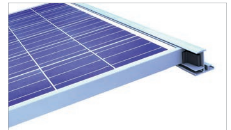
Module security at low roof inclination